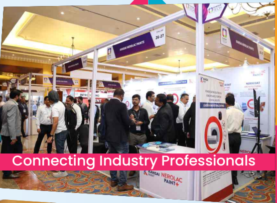
Connecting Industry Professionals