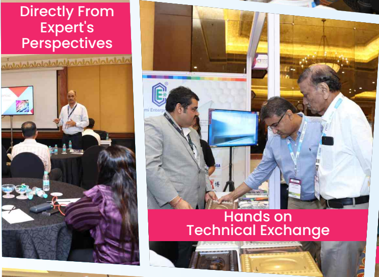
Hands on Technical Exchange