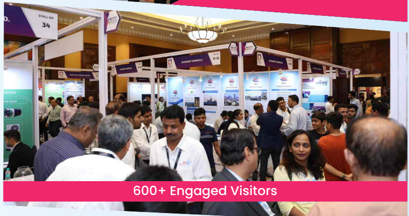
600+ Engaged Visitors