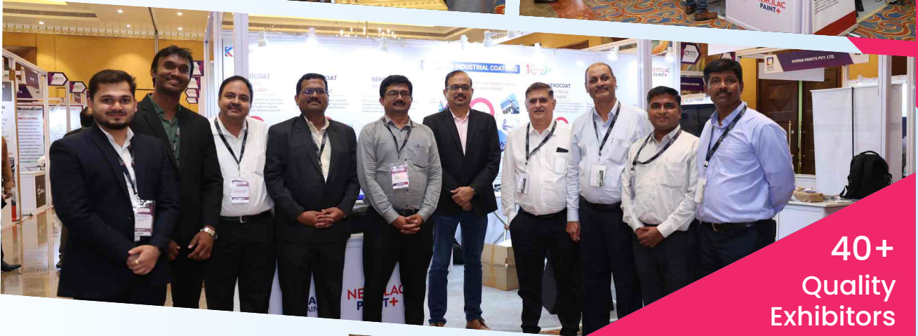
40+ Quality Exhibitors