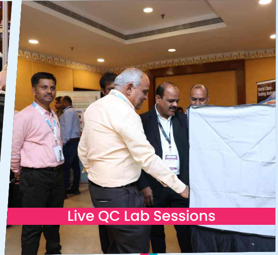
Live QC Lab Sessions